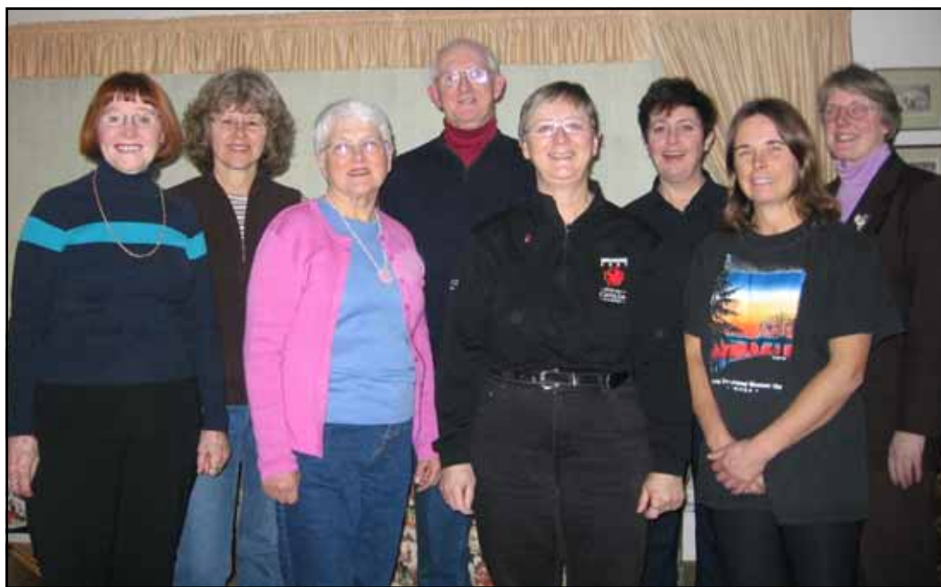
The 2008 members of the DVC Board of Directors are pictured at left.